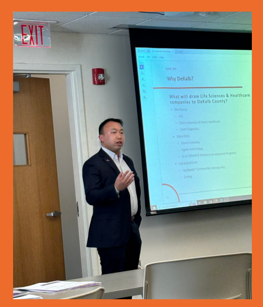
HEALTHCARE & LIFE SCIENCES COUNCIL

Complementing these targeted industry Councils is Advocate DeKalb, which fosters a colloborative exchange between Decide DeKalb and an interdisciplinary group of advisors, serving as a platform for shared learning and mutual feedback.