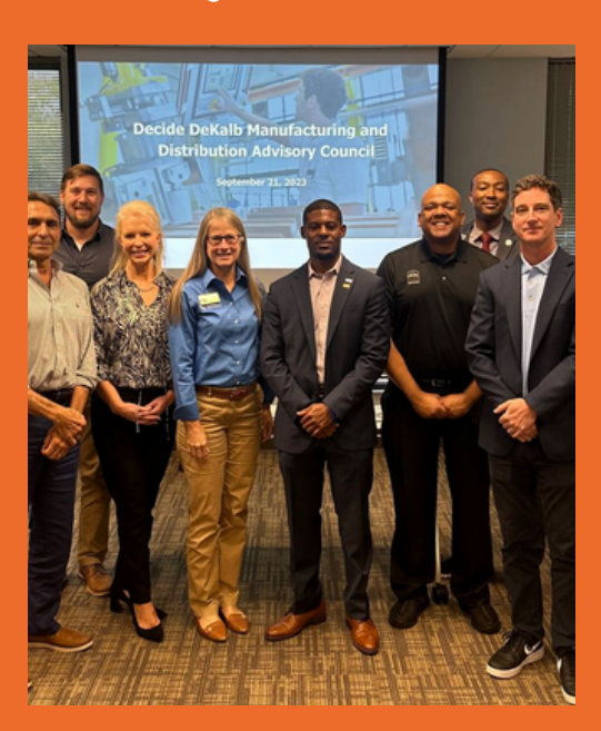
MANUFACTURING & LOGISTICS COUNCIL